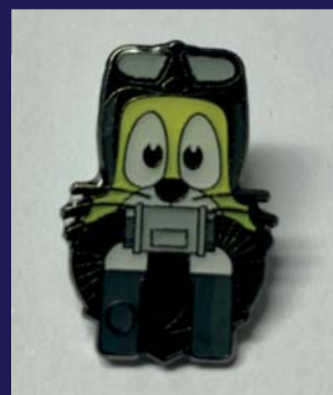
Navy Diver Pin Badge £2.50