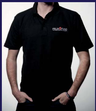
Mens black polo shirt £15.00 £10.00