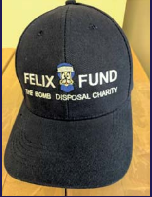
Felix Fund Baseball Cap £9.98