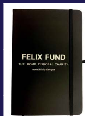
A5 Soft Touch Notebook £7.99