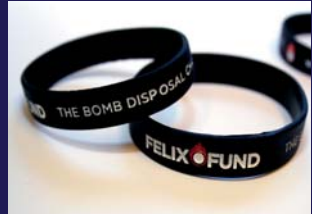
Wristband £2.00 £1.00