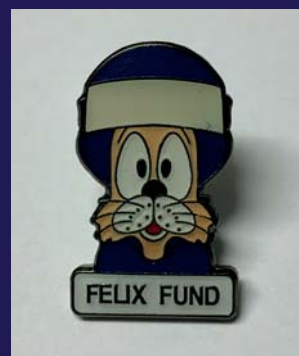
Blue Pin Badge £2.50