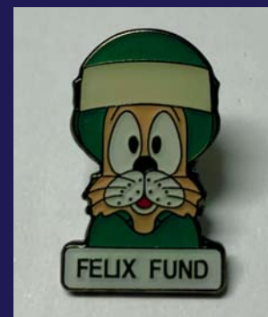
Green Pin Badge £2.50