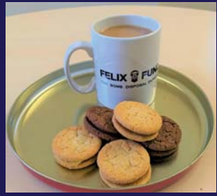
Felix Fund Mug £5.95

Don't forget to visit the Felix Fund shop